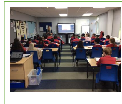
My new classroom – 6JO