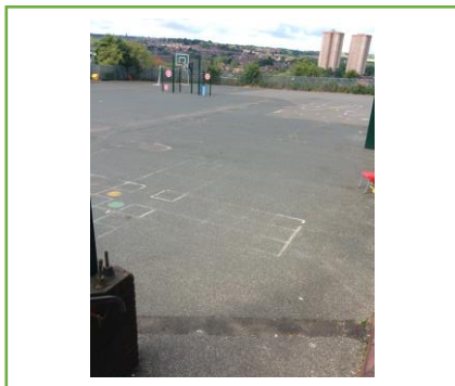
My new playground